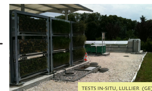
TESTS IN-SITU, LULLIER (GE)

2011-2014, hepia, studies on the substrate and vegetation of the VG Biobed