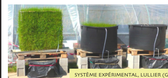
SYSTÈME EXPÉRIMENTAL, LULLIER (GE)

2009 -2010, hepia, studies on the efficiency of the VG Biobed