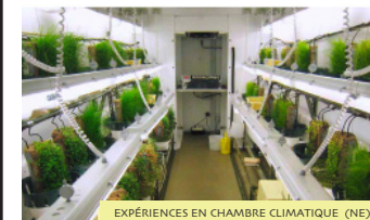
EXPÉRIENCES EN CHAMBRE CLIMATIQUE (NE)

2011-2012, Unine, studies on the substrate and herbicide tolerance of the vegetation